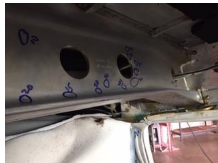
Carry-Thru-Spar Web With Severe Exfoliation Corrosion

We are an FAA Certified Mobile Repair Station and can return the aircraft to service. www.aerohoff.com / www.eddycurrentguys.com sales@aerohoff.com