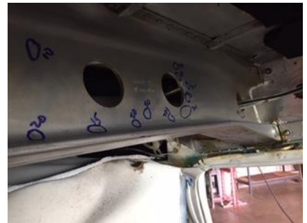
Carry-Thru-Spar Web With Severe Exfoliation Corrosion

We are an FAA Certified Mobile Repair Station and can return the aircraft to service. www.aerohoff.com / www.eddycurrentguys.com sales@aerohoff.com