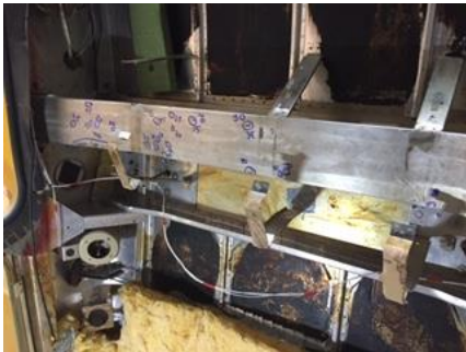
Carry-Thru-Spar With Severe Corrosion